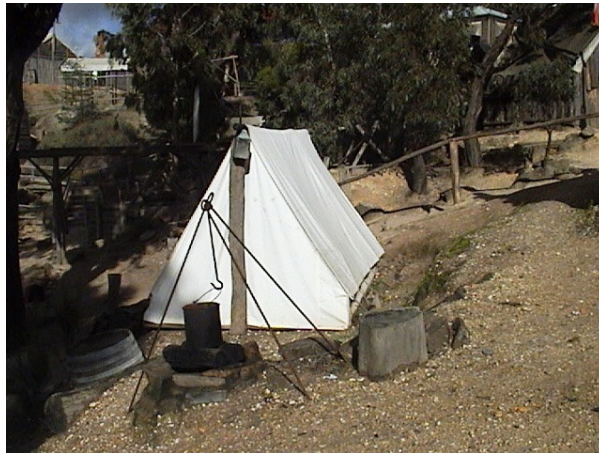
A Tent on the Red Hill Diggings at Sovereign Hill

Ellen Clacy set off from England to accompany her brother to the Victorian diggings in 1852. She seemed an 'ideal girl' to take to the diggings. One author said, ' She noticed everything, enjoyed everything, and willingly turned her hand to cooking, camping or washing for gold '.